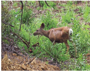
Mule Deer ( Odocoileus hemionus )

Mule deer belong to the family of Cervids (true deer) and are ruminants, those animals with four chambered stomachs. Deer generally weigh 125-200 pounds with the larger males (bucks)