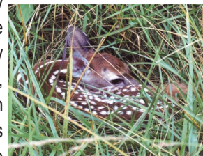
Fawn in hiding

If you come across a fawn leave it alone . Resist the urge to 'help' it. Fawns often die from the stress of handling by well-intentioned people who are unaware of the rearing methods of deer. Females leave their young in places they consider safe. The doe may disappear for many hours to forage and rest, but may stay away much longer if humans or dogs are in the area. If you are unsure a fawn needs assistance contact your local animal care and control facility.